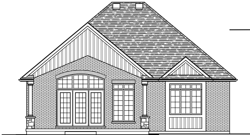
ELEVATION FACING WONDERLAND ROAD